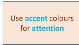
Accent colour Example